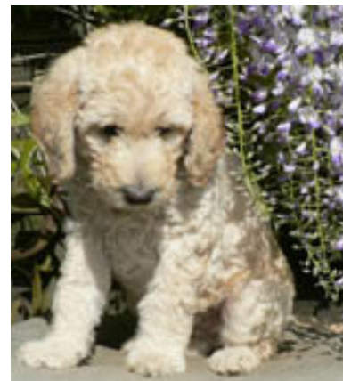
Scrumpty -Labradoodle puppy

If you would like to see your pet's photo in our newsletter, email it to enquiries@midforestvets.co.uk .